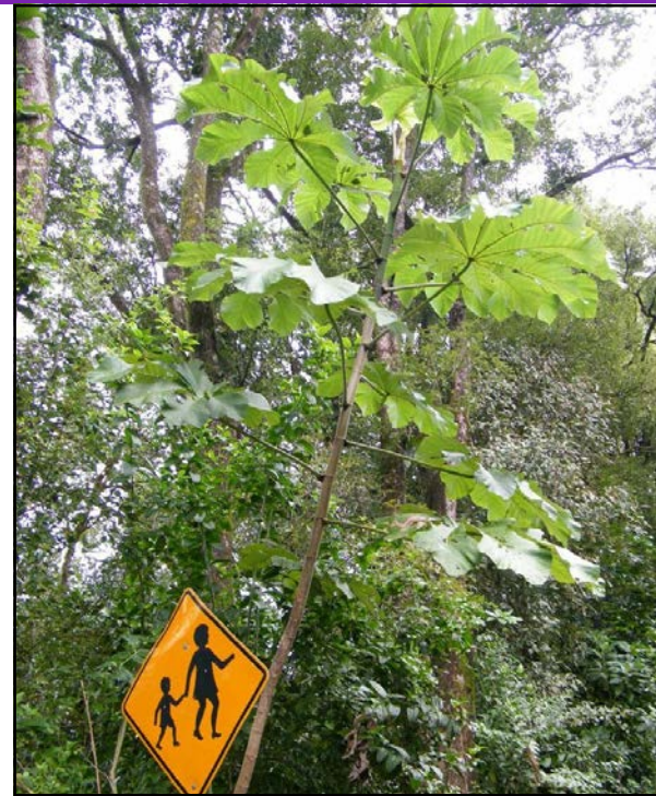
Cecropia peltata