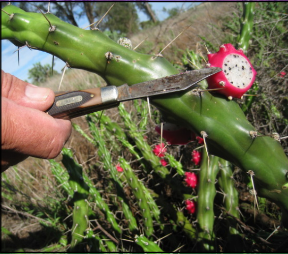
Harrisia Cactus | Image: N. Wale - Winner of Weed ID Photo Comp. 2013

Welcome members to the 5th edition of the Punnet Tray.